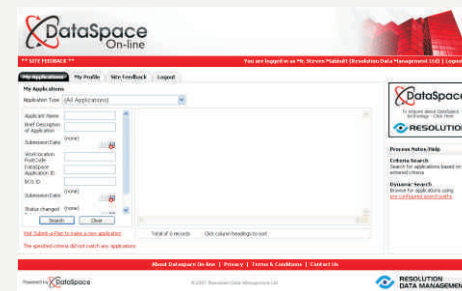
DataSpace On-line Screenshot

DataSpace On-line is a new addition to the LABC Submit-a-Plan Portal to help applicants manage their applications.