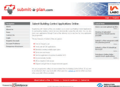
Submit-a-Plan Application Portal Screenshot

SNAP! Lite is continuously updated online ensuring that Local Authorities are always running on the latest version.